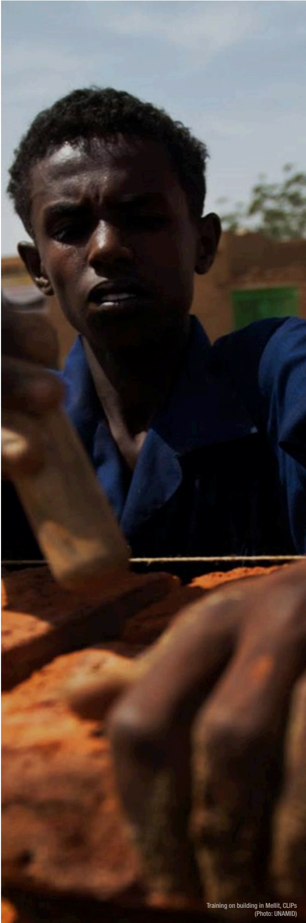
Training on building in Mellit, CLIPs