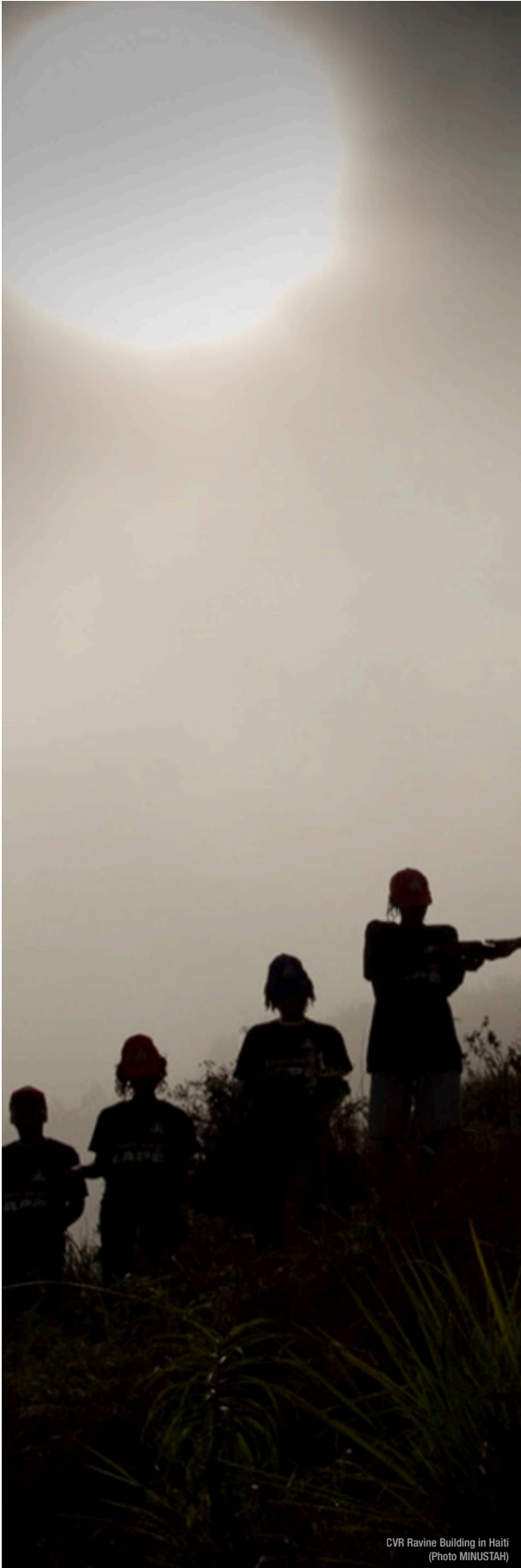
CVR Ravine Building in Haiti